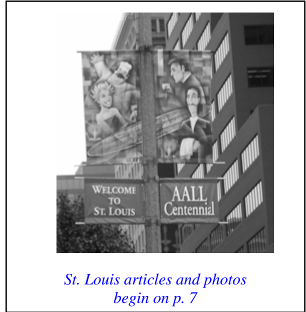
St. Louis articles and photos begin on p. 7