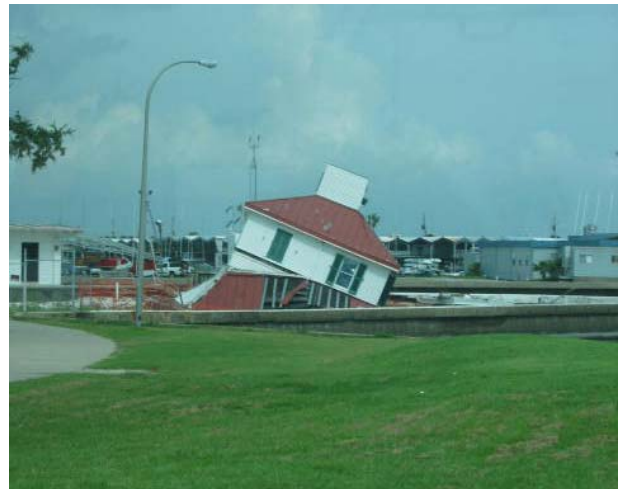
New Canal Lighthouse near Lake Pontchartrain. For more information, see lighthouse history and rescue efforts by the Lake Pontchartrain Basin Foundation

homes in the Musicians' Village with that easy, resilient spirit kids have, one could believe that just maybe the city will be able to find hope and spirit again.