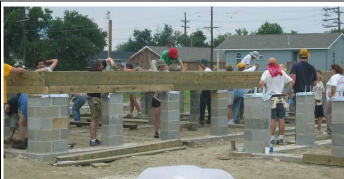
One of the AALL workgroups works hard on a "floor system," built on 3-foot concrete stilts, each covered with a piece of termite shield.

"Make Levees Not War" – I spotted this statement on a