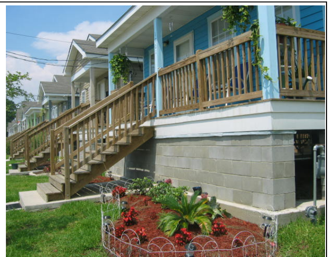
Completed Habitat for Humanity homes. Part of the Musicians' Village in the Upper Ninth Ward.

One AALL member at the Habitat site told how she had made a point of attending the meeting of the American Libraries Association in 2006 – the first post-Katrina conference held there. Attending the conference at that time enabled her to return to the city where she had gone to law school so that she could take advantage of a volunteer opportunity to work on gutting houses while wearing a Tyvek suit – and I'd thought the Habitat work was nitty-gritty!