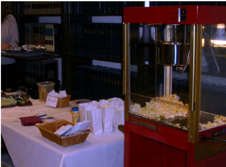
Treats and popcorn wagon at Reinhart.